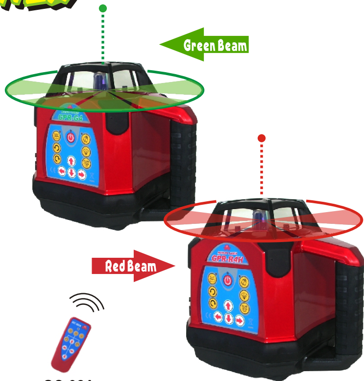
GC-92A Remote control